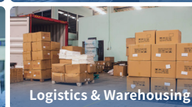
Logistics & Warehousing