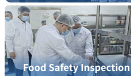
Food Safety Inspection