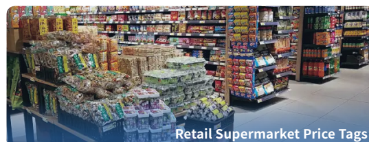
Retail Supermarket Price Tags